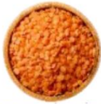
RED SPLIT LENTILS