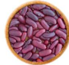
DARK RED KIDNEY BEANS