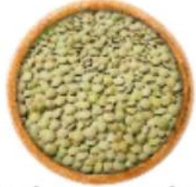
LAIRD GREEN LENTILS