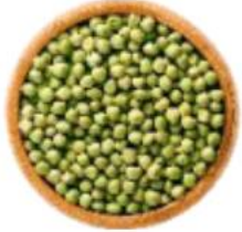
GREEN WHOLE PEAS