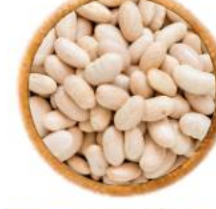
WHITE KIDNEY BEANS