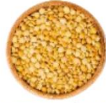
YELLOW SPLIT PEAS