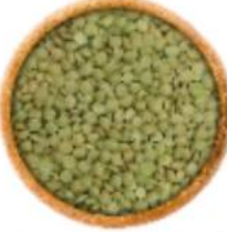
ESTON GREEN LENTILS