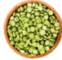
GREEN SPLIT PEAS