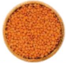
RED WHOLE LENTILS