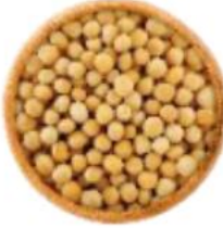
YELLOW WHOLE PEAS