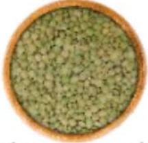
RICHLEA GREEN LENTILS