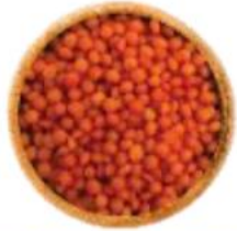
RED FOOTBALL LENTILS